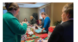
JHC Wichita elves wrap gifts for MHA.

Joseph Hollander & Craft Lawyers and Counselors LLC